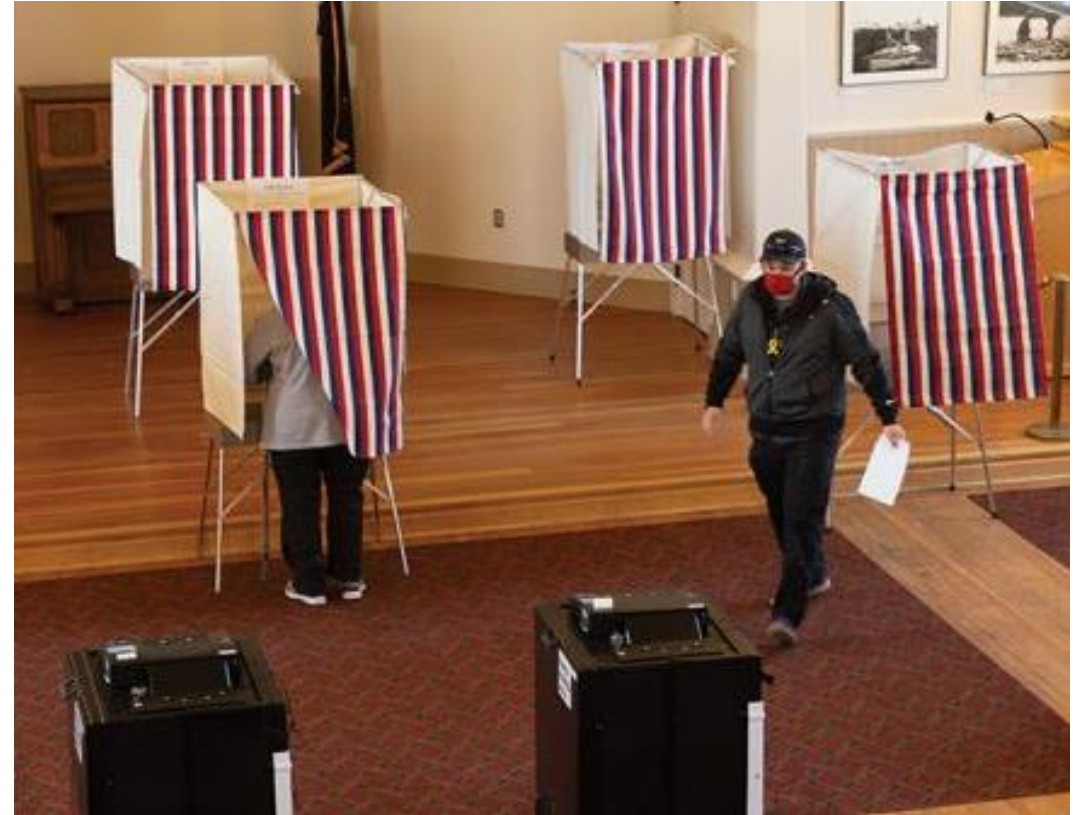
Voting at Old St. Joe's Hall in Nome