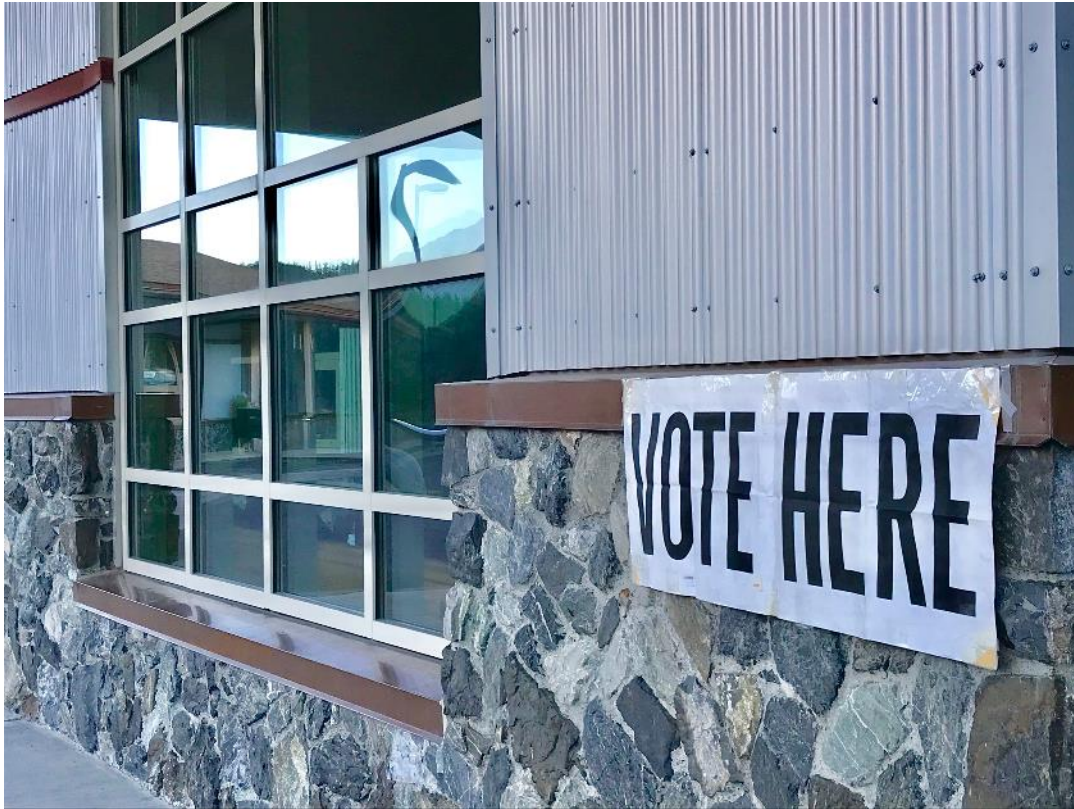
Cordova City Hall.