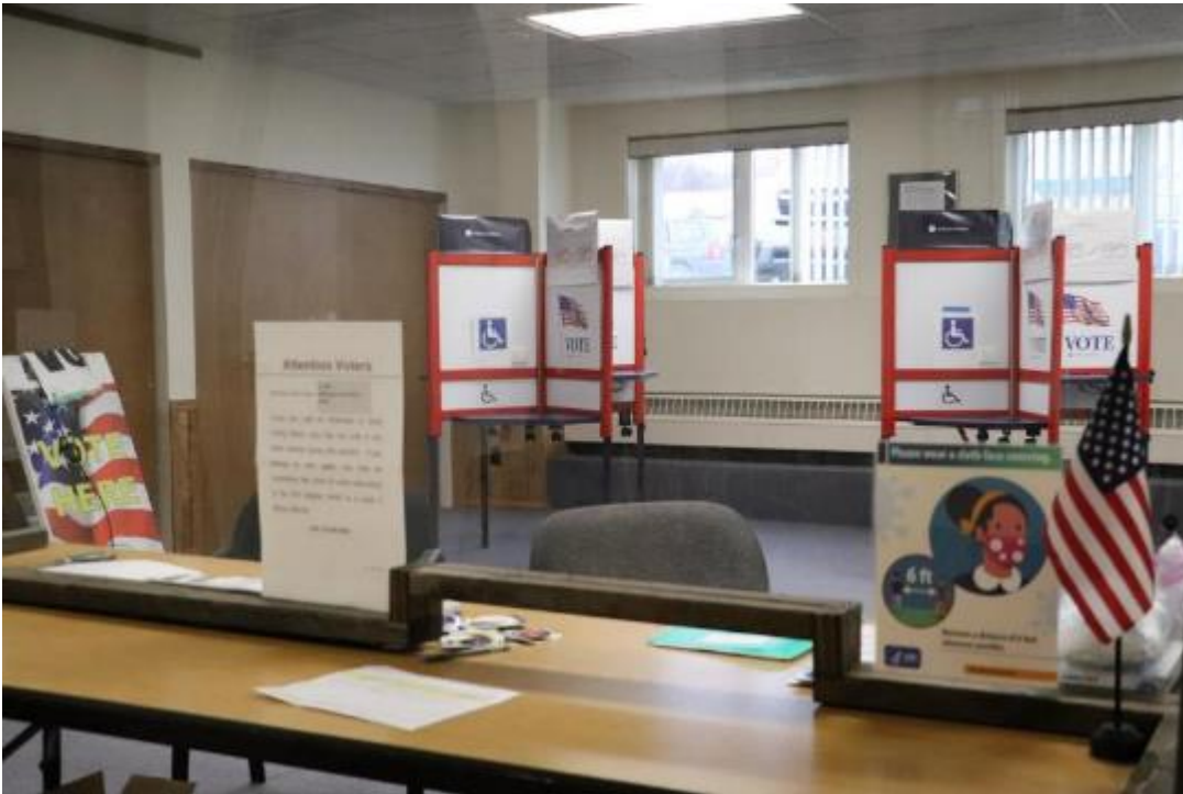
Dillingham City Hall in October 2020, (Photo by Isabelle Ross of KDLG)