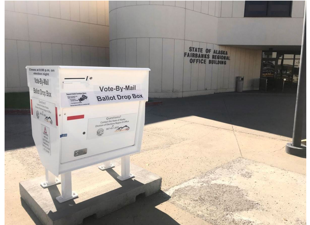
Drop box outside Fairbanks Regional Office Building