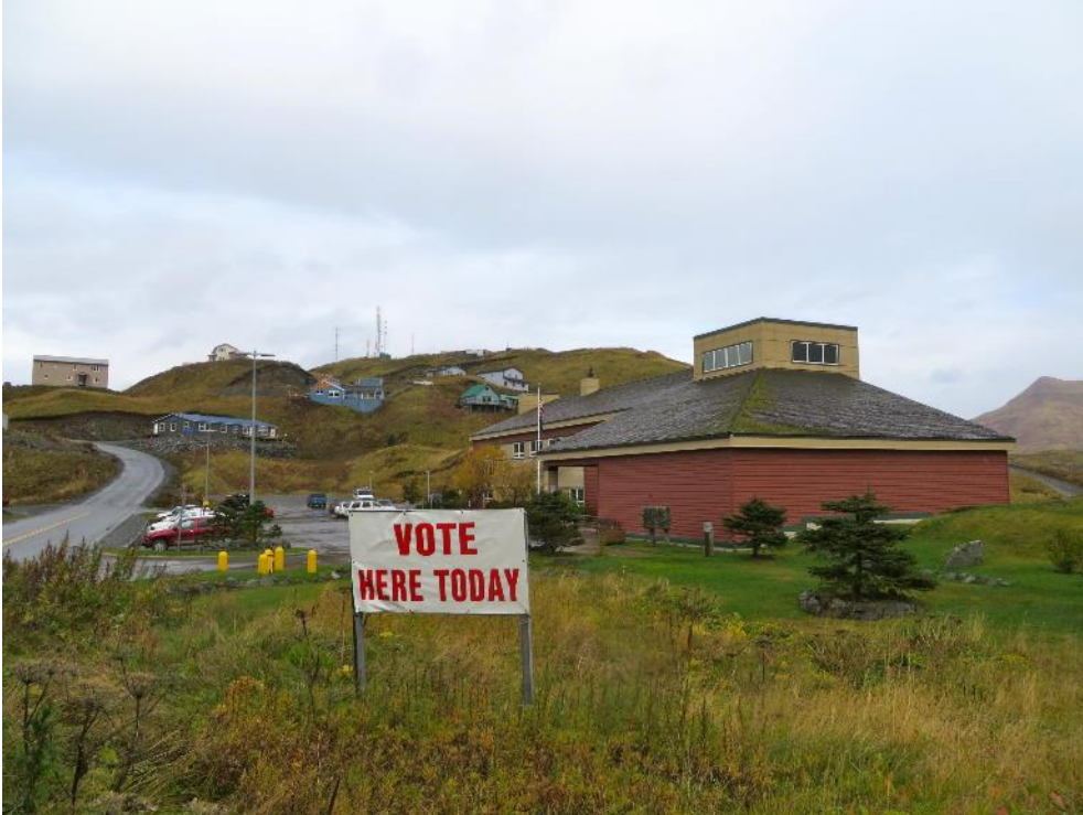
Unalaska City Hall, October 2020