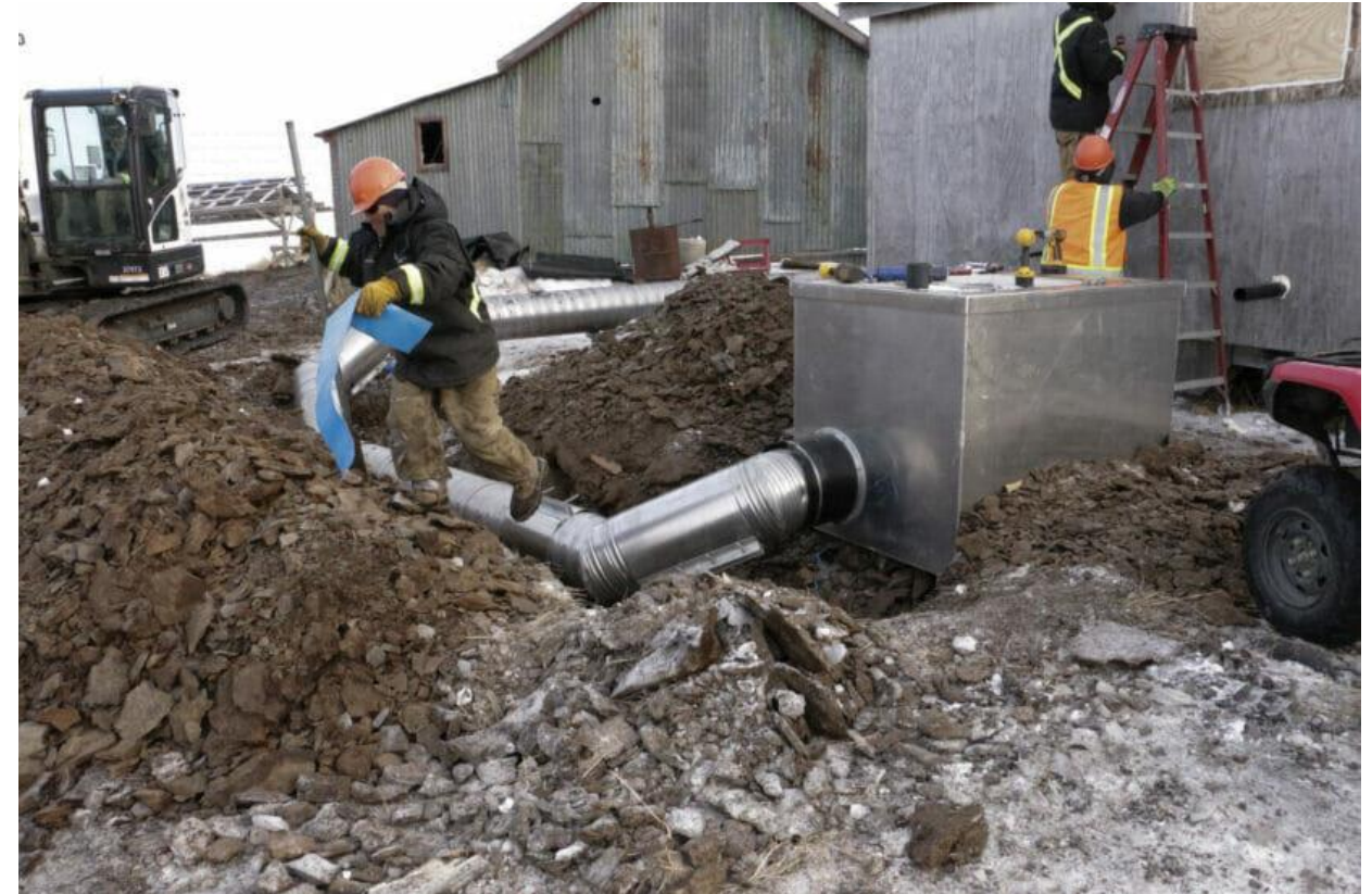
ANTHC workers install a water and sewer system to an Eek home on February 21, 2019.