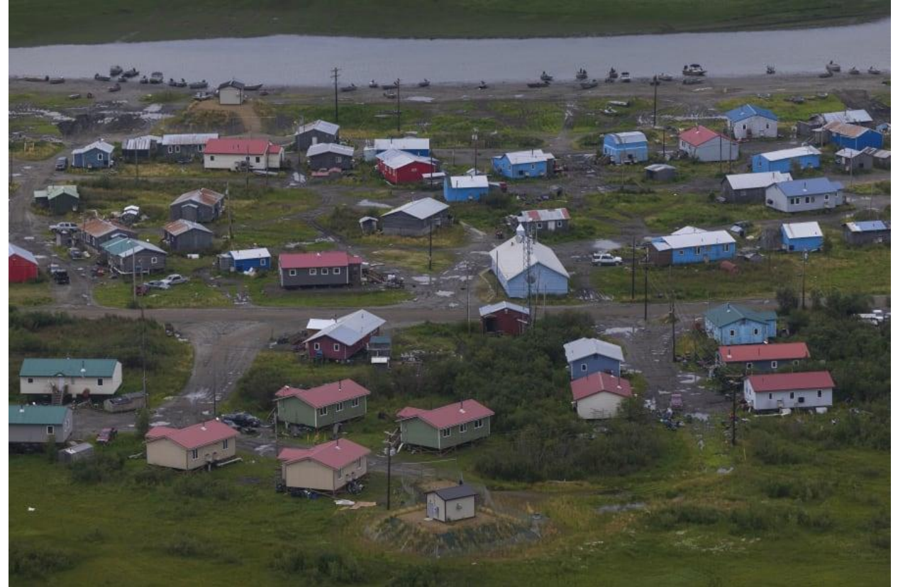
The village of Akiachak, Alaska, is visible from an airplane, Wednesday, Aug. 16, 2023. Akiachak is a Yup'ik village home to roughly 700 people based along the Kuskokwim River.