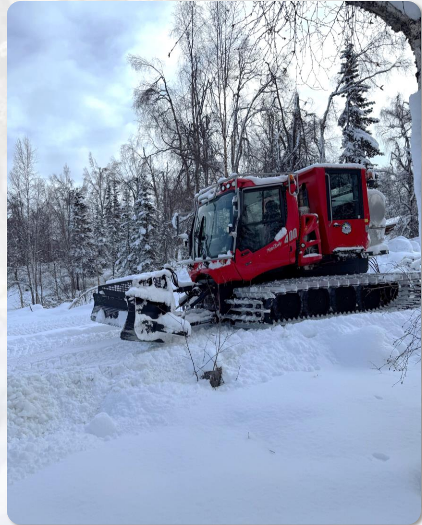
Grooming operations March 2025